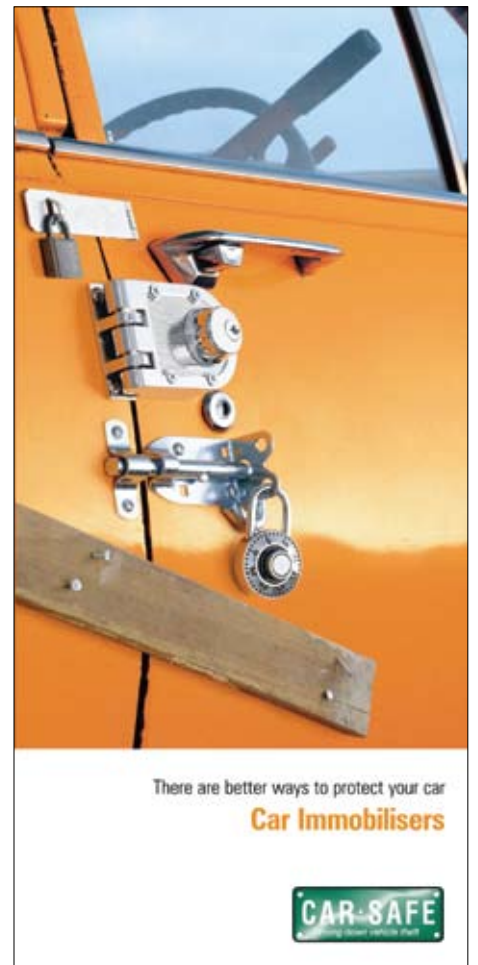
Examples of current Car-Safe education brochures.