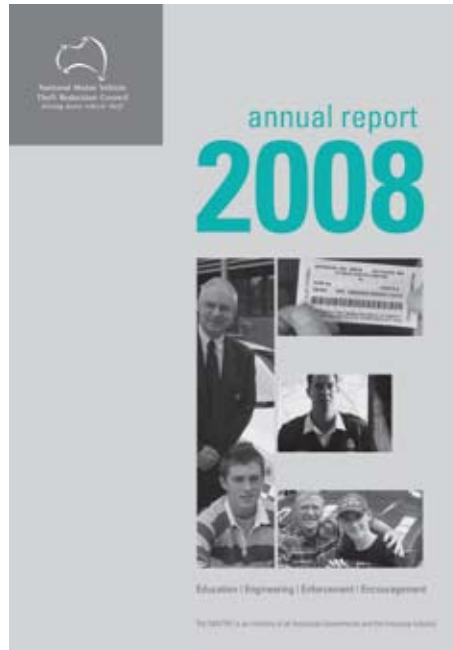
NMVTRC 2008 Annual Report cover.

Audits of registration authorities' conformance with agreed best practice principles for reducing fraudulent registration transactions were completed this year with the overall picture indicating high levels of general compliance. Required corrective