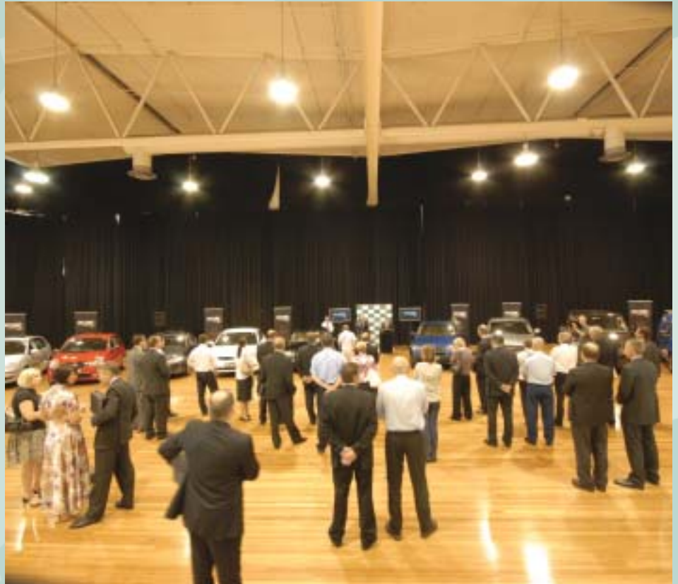
Guests listen to the presentations at the Sydney SBD launch at Olympic Park.